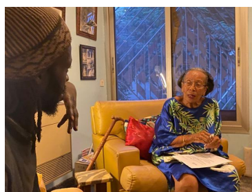
Interviewing in Dakar