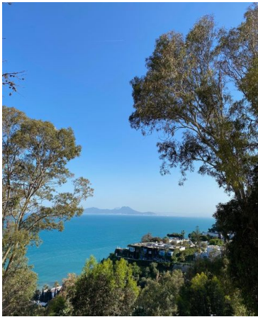
Sidi Bou Said, Tunisia